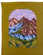
8. RMNP (2023) Wall hanging: mono screen-print with hand quilted border 29 x 24" $520