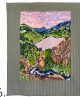
36. Summit Lakes (2023) Wall hanging: mono screen-print with hand quilted border 52 x 44" $1000