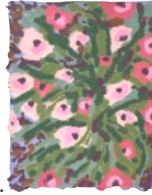
14. Pink Poppies (2023) Pulp Painting 14 x 11" $200