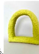
6. Chartreuse Arch (2023) Glazed stoneware $200