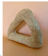
24. Bashed Arch 2 (2023) Stoneware $180