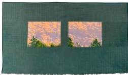
19. Clouds (2023) Wall hanging: mono screen-prints with hand quilted border 32 x 57" $1200