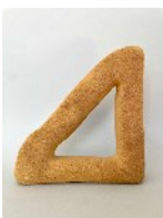
40. Bookend 1 (2023) Stoneware $180