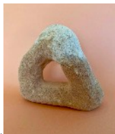
23. Bashed Arch 1 (2023) Stoneware $160