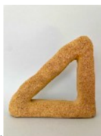
41. Bookend 2 (2023) Stoneware $180