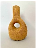
22. Holy Vessel 2 (2023) Stoneware, watertight $220