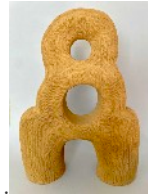
21. Views on views (2023) Stoneware $360