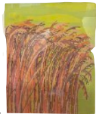
5. Turning Fields (2023) Pulp Painting 20 x 16" $480