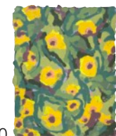
10. Eggs (2023) Pulp Painting 14 x 11" $200