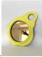
32. Chartreuse Mirror (2023) Glazed stoneware, mirror $140