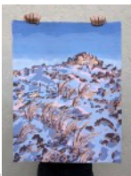
37. Iceland (2023) Pulp Painting 32.5 x 24.5" $1200