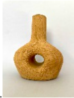
20. Holy Vessel 1 (2023) Stoneware, watertight $220