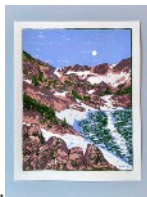
38. Alpine Lake (2023) Screen Print, 4 layers, Edition of 25 20 x 16" Framed, $140 14 x 11" Unframed, $80