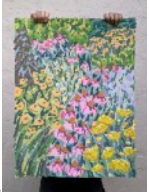
16. Meadow (2023) Pulp Painting 32.5 x 24.5" $1200