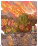
4. Autumnal Sky (2023) Pulp Painting 20 x 16" $480