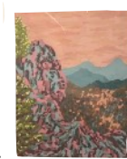
2. The Overlook (2023) Pulp Painting 20 x 16" $480