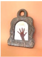
34. Wild Mirror (2023) Glazed stoneware, mirror $140