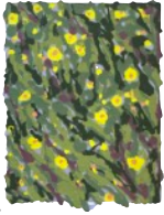
13. Little Eggs (2023) Pulp Painting 14 x 11" $200