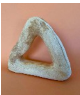
25. Bashed Arch 3 (2023) Stoneware $180