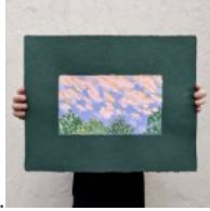
17. Cloud One (2023) Pulp Painting 18 x 24" $600