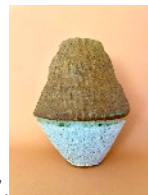
27. Lichen Vessel 1 (2023) Glazed stoneware $240