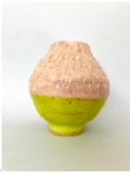
28. Lichen Vessel 2 (2023) Glazed stoneware $240