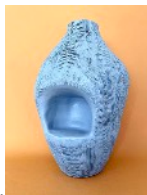
26. Vessel with Shelf (2023) Glazed stoneware, spray paint, watertight $360