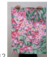
12. Orchid Party (2023) Pulp Painting 32.5 x 24.5" $1200