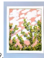
39. Aspens (2023) Screen Print, 4 layers, Edition of 25 20 x 16" Framed, $140 14 x 11" Unframed, $80