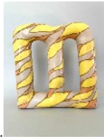
29. Double Arch (2023) Glazed stoneware $260