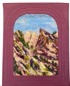
7. Eldorado Canyon (2023) Wall hanging: mono screen-print with hand quilted border 29 x 24" $520