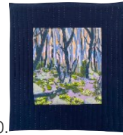
30. Wooded Virginia (2023) Wall hanging: mono screen-print with hand quilted border 24 x 21" $480