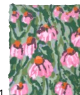
11. Coneflowers (2023) Pulp Painting 14 x 11" $200