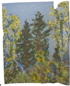
1. Aspen Grove (2023) Pulp Painting 20 x 16" $480