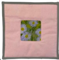
35. Alpine Daisy (2023) Wall hanging: mono screen-print with hand quilted border 10 x 10" $120