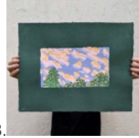
18. Cloud Two (2023) Pulp Painting 18 x 24" $600