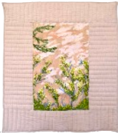
31. Aspens, blue (2023) Wall hanging: mono screen-print with hand quilted border 30 x 27" $600