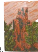
3. Garden of the Gods (2023) Pulp Painting 20 x 16" $480