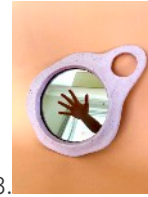
33. Lilac Mirror (2023) Glazed stoneware, mirror $140