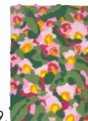
9. Little Orchids (2023) Pulp Painting 14 x 11" $200