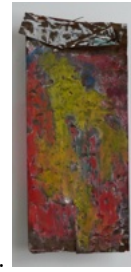
12. Noah Schneiderman In Vacuo (2023) Oil and oil pastel on found metal with wood and gouache 10.5 x 4.5" $1,050