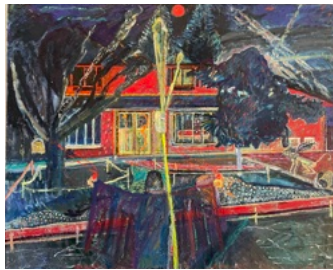
14. Mark Andrew Farrell Friday the 13th (2023) Oil on canvas 48 x 60" $2,300