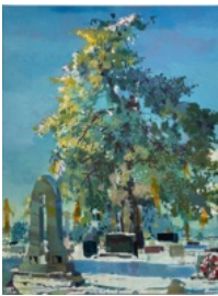
13. Daniel Granitto Crown Hill (Bright White Sheet) (2023) Oil on canvas 48 x 36" $2,800