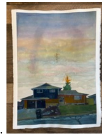
3. Daniel Granitto Pre-dawn (2022) Watercolor on paper 15 x 10.5" $500