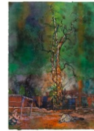
6. Daniel Granitto Scraggler (2020) Watercolor and colored pencil on paper 15 x 10.5" $450