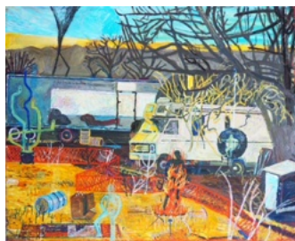
8. Mark Andrew Farrell Wastelands (2022) Oil on canvas 48 x 60" $2,300