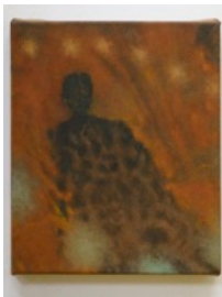
7. Noah Schneiderman Death and Other Small Acts (2022) Oil and wax on canvas naturally dyed with cutch and iron 12 x 10" $1,500