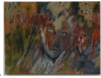
15. Noah Schneiderman Rush (2023) Oil on linen naturally dyed with madder root, marigolds, and chlorophyllin 12 x 16" $1,900