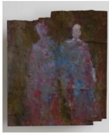
11. Noah Schneiderman Tandemned (2023) Oil and oil pastel on found metal with wood and gouache 6.25 x 5.5" $800