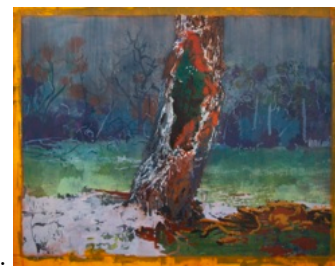
9. Daniel Granitto Gape (2023) Oil on canvas 24 x 30" $1,600