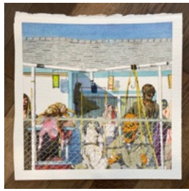
2. Daniel Granitto In Broad Daylight (2021) Watercolor on paper 10.5 x 10.5" $450