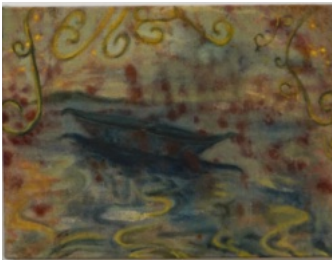
16. Noah Schneiderman The Waiting (2023) Oil on linen naturally dyed with madder root, marigolds, and chlorophyllin 12 x 16" $1,900