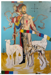
1. Walking the Dogs (2022) Oil, acrylic, crayon, and spray paint on canvas. 60 x 42" $3,000