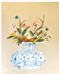
7. Family Vase #2 (2022) Acrylic and oil on canvas 50 x 40" $2,750