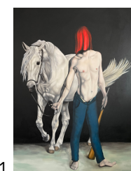
11. The Enemy (2022) Oil and acrylic on canvas 56 x 40" $2,750