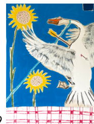
9. Swan Dive (2022) Oil and acrylic on canvas 40 x 30" $1,000