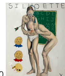
10. An Argument for Play #1: Failed the Spelling Bee (2020) Acrylic and oil on canvas 30 x 24" $750