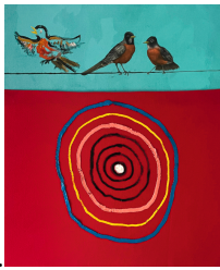
2. One Flew (2022) Oil, acrylic, and felt 36 x 30" $1,000