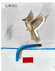
8. Untitled (2022) Oil and acrylic on canvas 20 x 16" $200