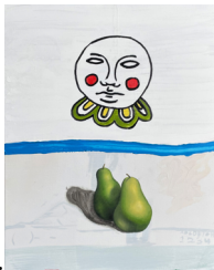
5. Untitled (2022) Oil and acrylic on canvas 20 x 16" $200