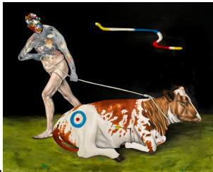
4. Walking the Cow (2022) Oil and acrylic on canvas 48 x 60" $3,000