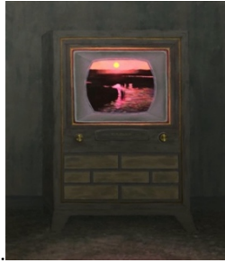
2. Color TV (2022) Acrylic on panel over canvas 32x24" $2,300