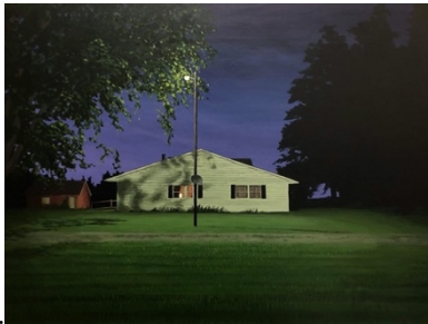
5. Dunlap Family Home (2021) Acrylic on panel 24x32" $2,300