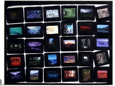
3. Together (2020) Acrylic on panel 8.5x11" NFS