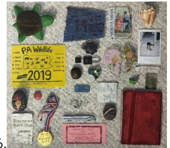
6. Objects in Space (2022) Acrylic on panel 15x15" $1,500