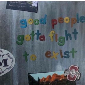
4. Untitled (2020) Acrylic on panel 12x12" $900