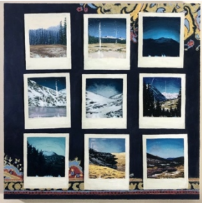
1. For Me (2022) Acrylic on panel 15x15" $1,300