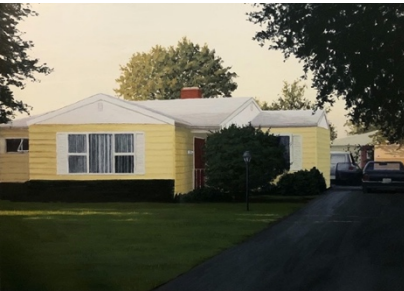
7. Grammy Chalfant's House (2021) Acrylic on panel 20x28" $2,000