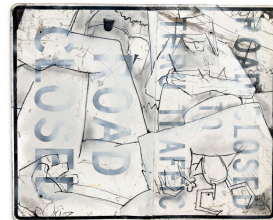
11. The Thief Drawing Beauty Nov 28, 2022 Oil and spray paint on found object 48 x 60" $2100