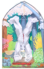
2. Beauty's Crucifixion Oct 15, 2022 Oil and spray paint on plywood 108 x 72" $6200