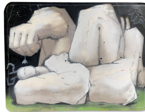
8. Beauty Lounging Aug 28, 2022 Oil and spray paint on found object 36 x 48" $750