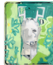
12. Beauty's Head Nov 30, 2022 Oil and spray paint on found object 36 x 24" $500

Bell Projects seeks to support local artists and their work by curating and presenting exhibitions on a monthly basis in their gallery space located at 2822 E. 17 th Avenue, Denver, Colorado 80206. All exhibitions are free to attend and are open to the public. For more information, please email info.bellprojects@gmail.com or visit bell-projects.com