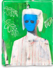
5. The Thief Aug 31, 2022 Oil and spray paint on found object 36 x 24" $500