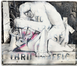
7. The Kill Aug 16, 2022 Oil and spray paint on found object 50 x 60" $2700