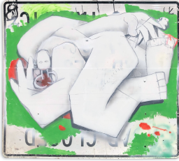
4. Beauty's Corpse Aug 20, 2022 Oil and spray paint on found object 48 x 60" $2600