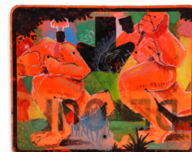
9. The Chase Nov 2, 2022 Oil and spray paint on found object 24 x 30" $450