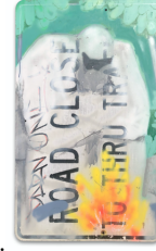
6. Truth and Fire Nov 30, 2022 Oil and spray paint on found object 48 x 30" $1100