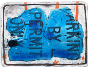
10. Beauty Lounging II Nov 1, 2022 Oil and spray paint on found object 15 x 24" $250